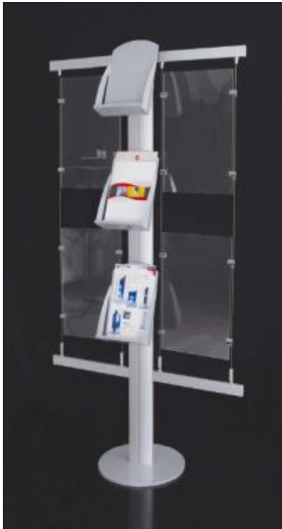
Available size = A4 Nett weight = 21.5kg LT-18