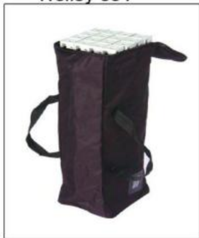
Nylon bag 001