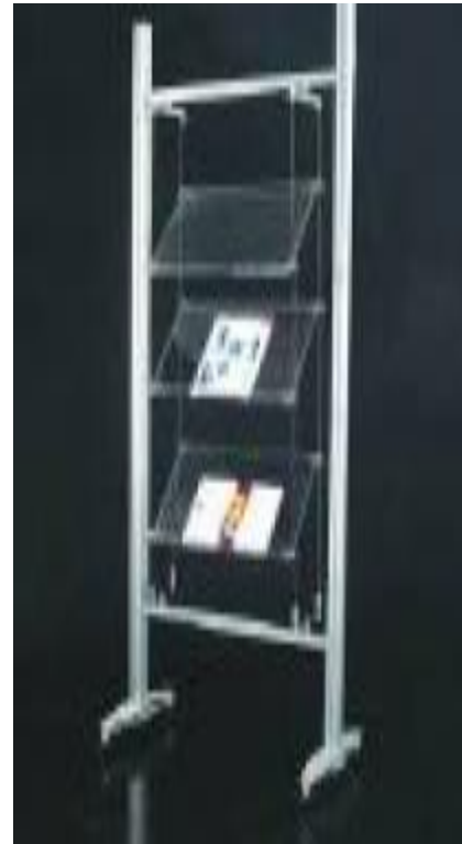
Available size = A4 Nett weight = 13kg LT-18A